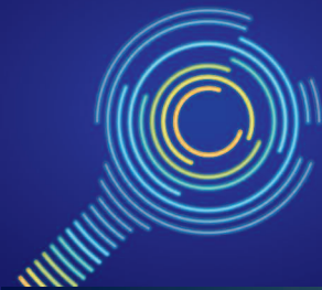
Scrutiny committee in session 2018